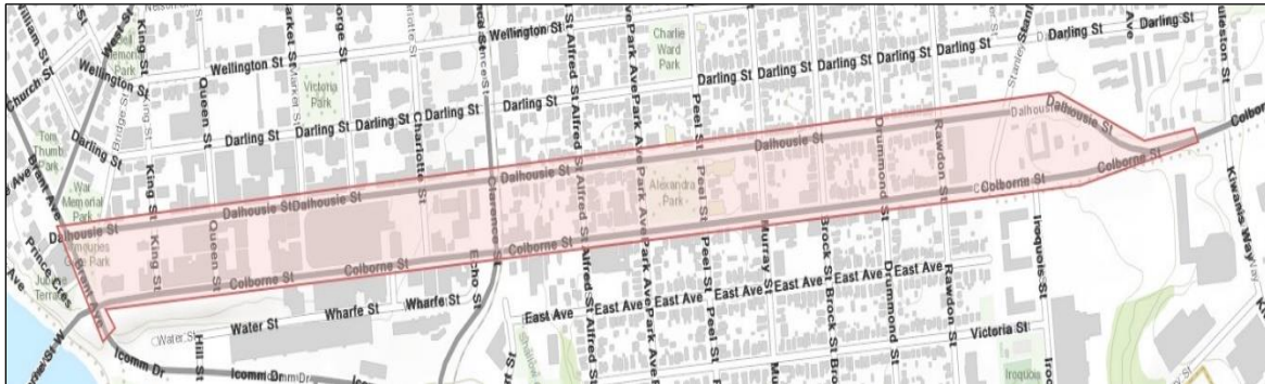
Map 1 - Full Study Area