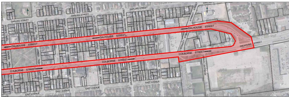
Map 3 - Close up of Study Area, Part 2

This notice first issued on November 19, 2020.